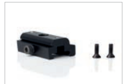
PICATINNY RAIL MOUNT (OPTIONAL)