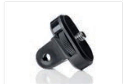
ACTION CAMERA MOUNT